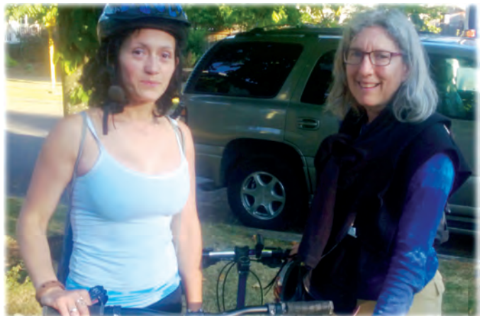
Catherine Place cycling enthusiasts teamed up to join in the Cycle the Wave event.

85 women participated in Juntas en Transición (Together in Transition), Pierce County's only ongoing domestic violence prevention and support program offered in Spanish.